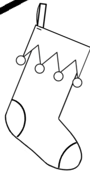
stocking top →